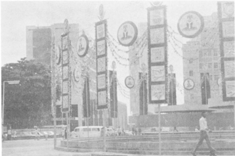
Tafawa Balewa Square with FESTAC decorations