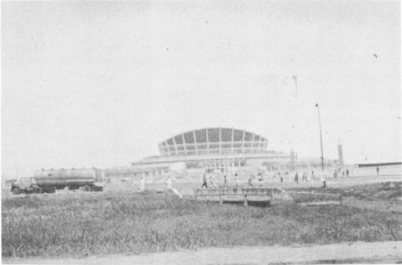
The New National Theater