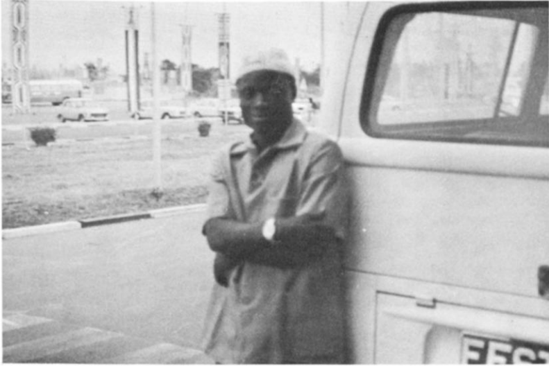
FESTAC Chauffeur and Bus