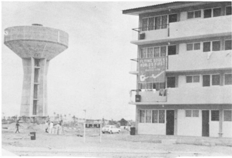
Festival Village – USA Buildings